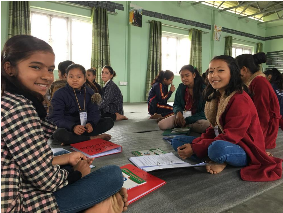
Participants gather each week to learn and practice personal development and business building skills. They will each create an innovation business experiment to practice what they are learning.

Her International, with financial support from SureCall Contact Centers through their GoodCall program, launched a personal development course in January 2019. This program is a course offered to adolescent girls who will use an innovative hands-on approach to connect each participant with their innate ability to be a leader in their own life and her community. Each girl will be driven to stand in her own power, encourage and empower those around her. The participants will learn personal development skills such as problem solving, communication, teamwork, and leadership through their entrepreneurship project. After completing the training and business project, they are invited back to serve as mentors to their peers taking the next round of training.